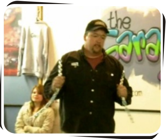
Breaking the Chain, 2007