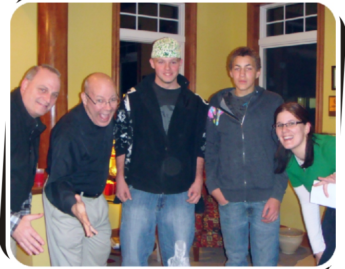
Sponsors and Teens, Christmas 2009